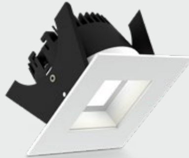
Diffuser HV-FD 80°

Standard with CS spring (concrete/gyproc). Also available as above with WS spring (gyproc/metal).